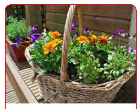
Quintrell Downs Gardening Club who raised £50 whilst we were their charity of the year.