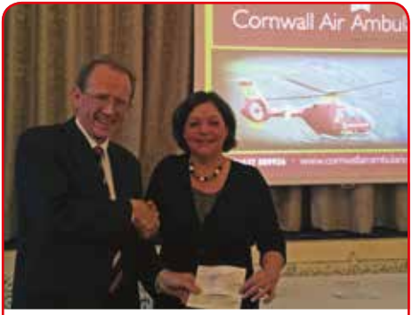
The Devon and Cornwall Concrete Society who donated a fantastic £500 to us as their chosen charity for the year.