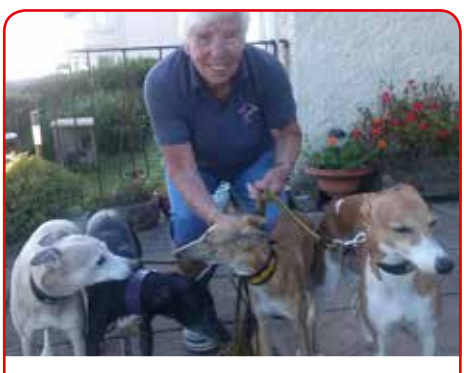
The organisers (and dogs!) of the Lizard Whippet Race 2013 for raising £600.