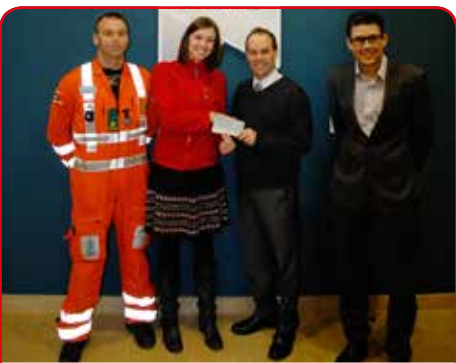
Impact Fluid Solutions for a huge donation of £5,250 after their staff chose to support Cornwall Air Ambulance.