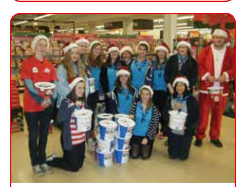
The 6th St Austell Guides who donned their Santa hats and raised a fantastic £659.11 at Sainsburys Truro.