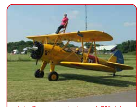
Anita Gripe, who raised over £1700 doing a sponsored weight loss to allow her to be able to take part in a wing walk.